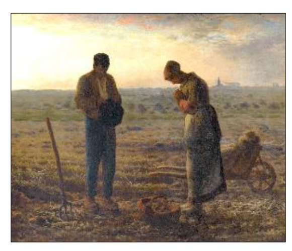
Jean-François Millet, ca 1859. The painting depicts two peasants in a field bowing over a basket of potatoes to say a prayer, the Angelus; with the ringing of the bell from the church on the horizon, it marked the end of a day's work.

I confess that the call at 6 a.m. did not bring me leaping out of bed – the eucharist was at a later hour; but 12 and 6 pm often came in the breaks before lunch and dinner. We would be somewhere around the convent, by ourselves or having conversation. At the first bell, we learned, one fell silent. I did not then know the words, but I learned to love silence.